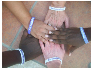
Partnering for prevention

Since 2009 Stop It Now! has been extending our work globally, with generous support from the Oak Foundation (Geneva) , a leading foundation funding child abuse prevention work. We have increased our global presence through online channels, and participation in key meetings and networks. We have benefited greatly in so many ways.